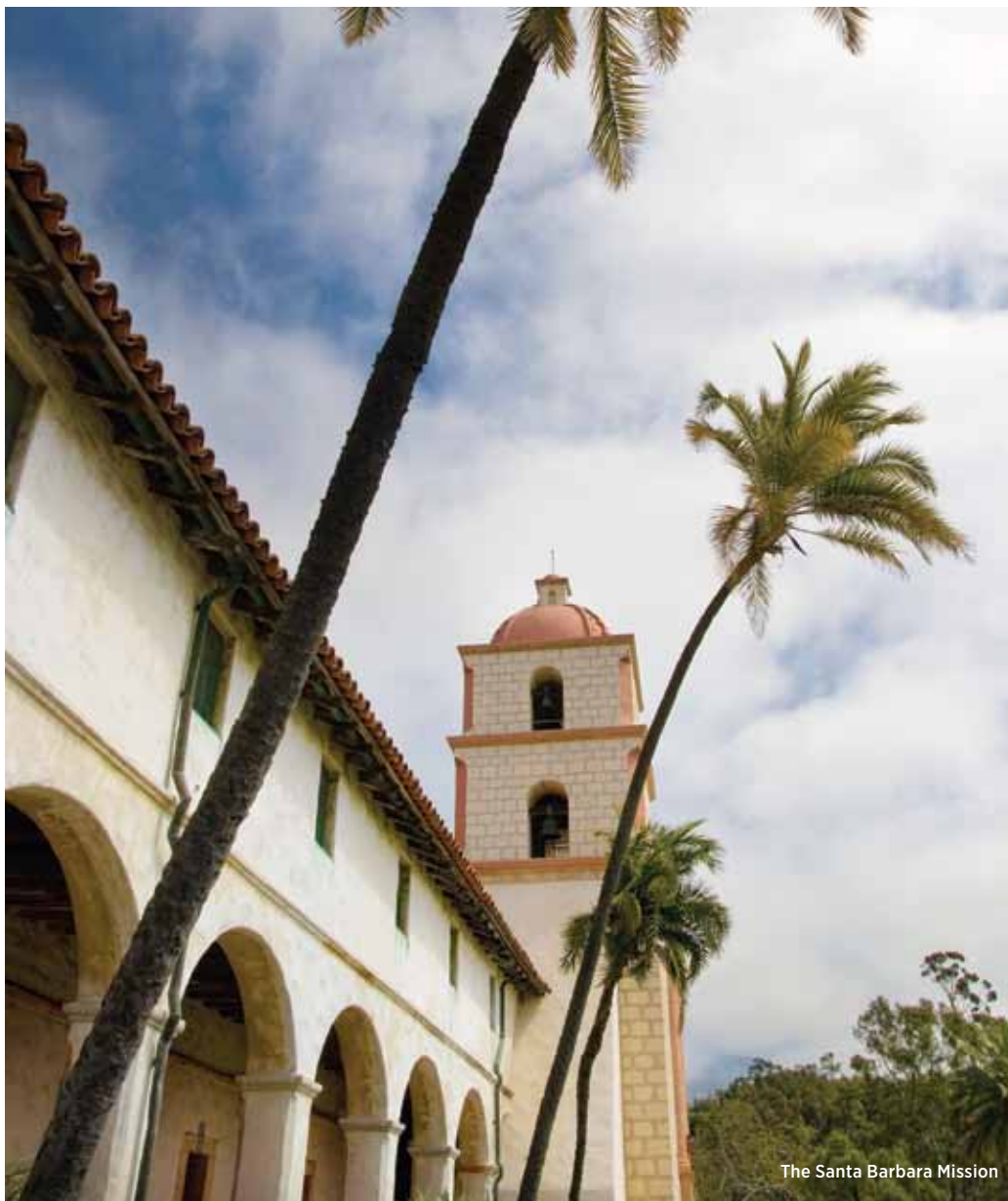
The Santa Barbara Mission