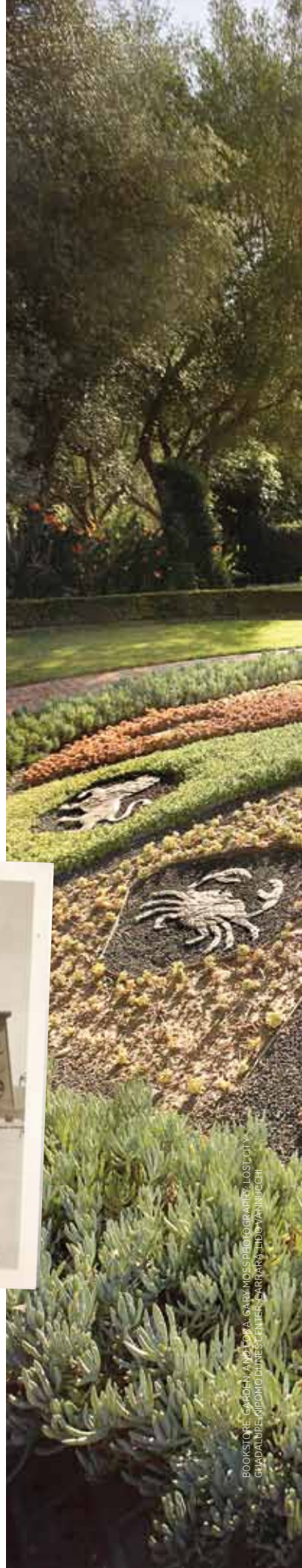
BOOKSTORE: GARDEN AND LION: GARY MOSS PHOTOGRAPHY; LOST CITY: GUADALUPE-NIPOMO DUNES CENTER; SARRARA: LUDOVIC ANNUCCI

Guadalupe-Nipomo Dunes, a National Natural Landmark near Pismo Beach, is California's largest coastal dune-wetlands complex and boasts the highest beach dunes in the Western United States, some as high as 500 feet. Movie sets for Cecil B. DeMille's film The Ten Commandments —his first version, a silent film made in 1923—are partially buried in the dunes, making the area a tourist destination. In 2012 and 2014, archaeologists unearthed the remains of two colossal plaster sphinxes from The Lost City of DeMille, one of which is now on display at the Dunes Center ( dunescenter.org ).