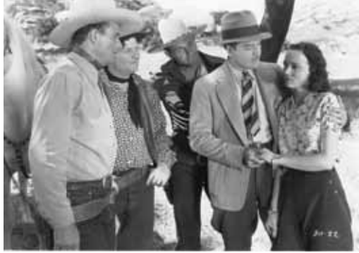
Corriganville Park: John Wayne during filming of 1938's Pals of the Saddle in the open field that would later become a western street set called Silvertown.