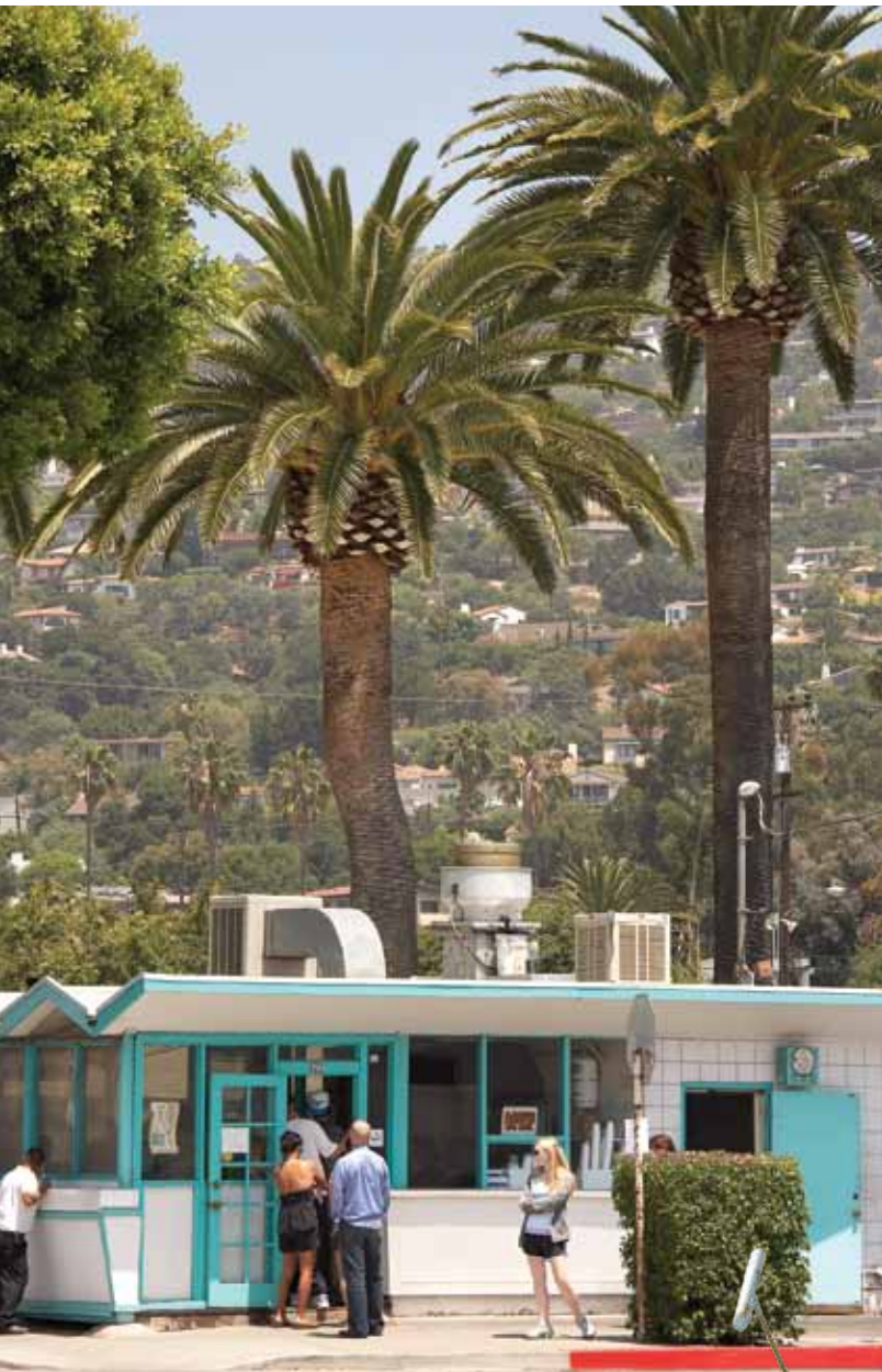
Tacos just like the ones Julia used to eat