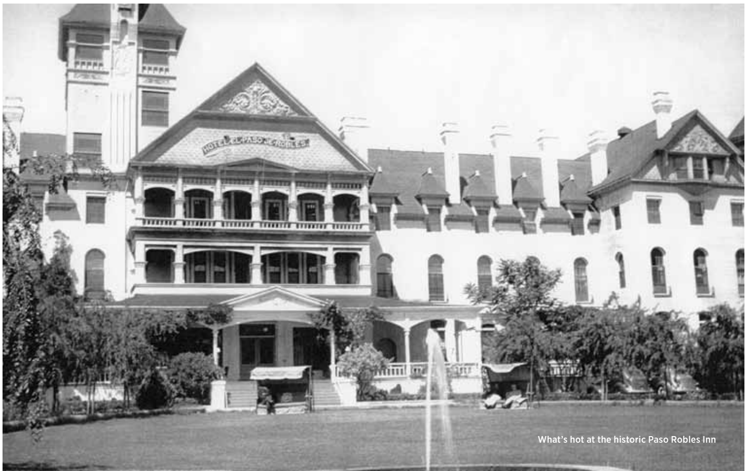
What's hot at the historic Paso Robles Inn