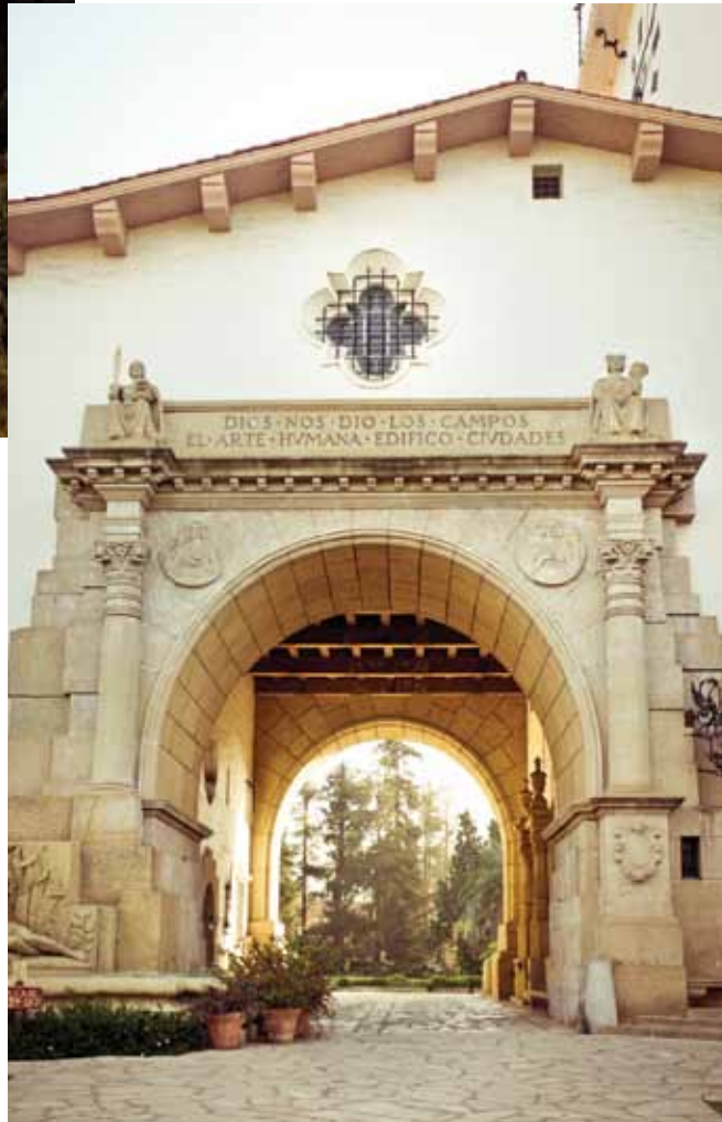
The Spanish Colonial Revival stylings of the Santa Barbara County Courthouse

When surfer and climber Yvon Chouinard opened a climbing gear store more than 40 years ago, he chose a Ventura location because of the area's beauty and proximity to great waves and accessible backcountry. Now a major retailer of outdoor sports, Patagonia ( patagonia.com ) has a synergistic relationship with Central Coast residents due to its commitments to environmental activism, the humane treatment of animals, and charitable efforts.