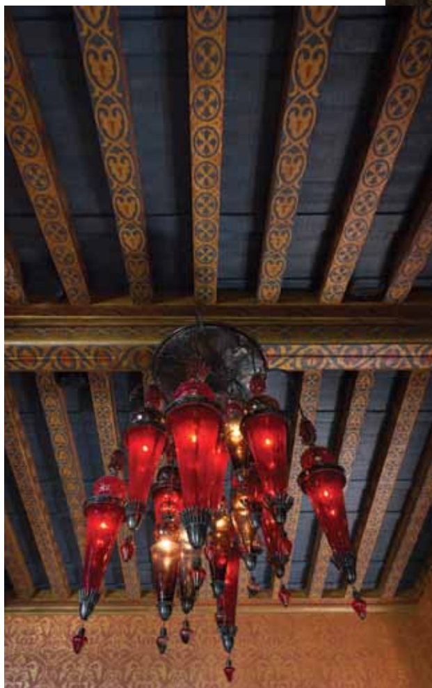
What's up at Ty Lounge: The ceiling, designed with the vision of the hotel's original 1926 architect Reginald Johnson in mind, takes its blue, green, gold, and red palette from the mural room at the Santa Barbara Courthouse.

Some of the best views around are just over our heads, like the ceiling of recessed illustrated panels transplanted from a 15th-century Spanish convent over the entrance to Montecito's Casa del Herrero ( casadelherrero.com ). The delicate wood-cutout design of the ceiling at the Music Academy of the West's Hahn Hall ( musicacademy.org ) serves acoustic purposes. The historic Hearst Castle ( hearstcastle.org ) in San Simeon boasts multiple grandiose ceilings including that of the Casa del Monte Guest House, which is adorned with 22-karat gold. The ceiling of the Fremont Theatre ( fremont.themovieexperience.com ) in San Luis Obispo features Art Deco sculpted swirls and neon lights, while the newly restored Ty Lounge at Four Seasons The Biltmore Resort Santa Barbara ( fourseasons.com/santabarbara ) fuses Spanish and Moroccan style with 109 richly colored and detailed overhead beams. So, when you're looking around, don't forget to look up.