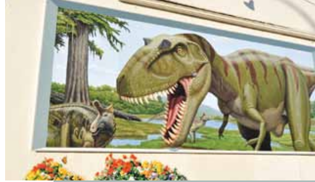
Feeding Time , the newest addition to Lompoc's Art Alley