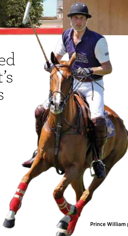
Prince William played here.

Small in size but big on flavor, Santa Barbara's La Super-Rica taqueria (above, 805-963-4940) was a favorite of Julia Child's and remains a destination for fans of Julia and tacos alike. Don't let the line deter you: The fresh tortillas are worth the wait.