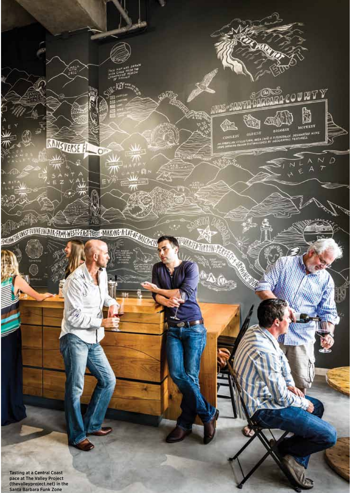
Tasting at a Central Coast pace at The Valley Project (thevalleyproject.net) in the Santa Barbara Funk Zone