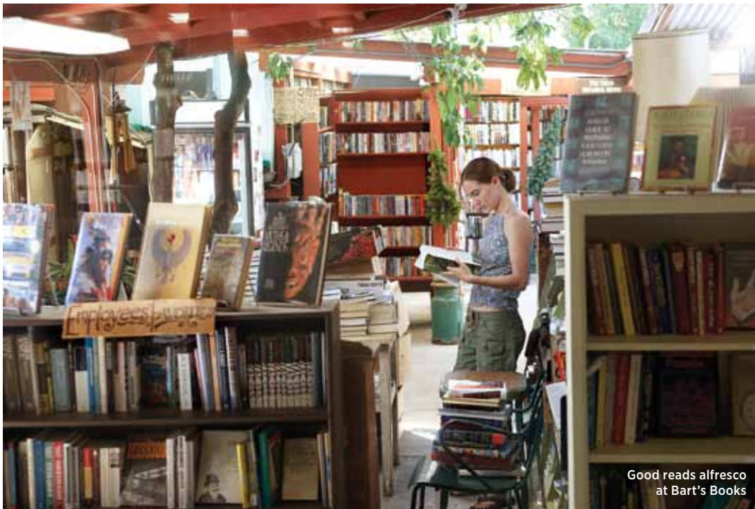
Good reads alfresco at Bart's Books