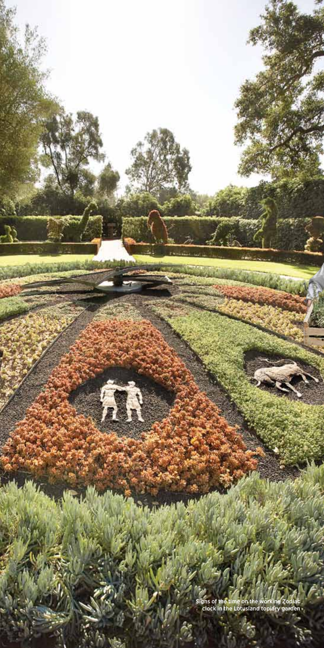
Signs of the time on the working Zodiac clock in the Lotusland topiary garden